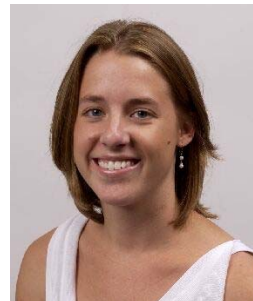
Little , Holly Comm: 260 MB:405 Pager num: 56071