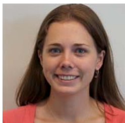
Rent , Sharla Comm: 240 MB:346 Pager num: